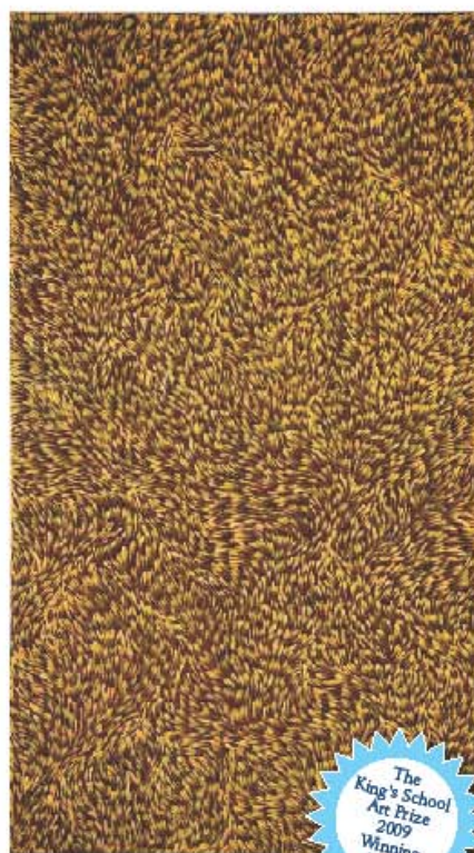
Artist: Glöia Petyarre Title: "Untitled (Leaves) 2006" Size: 180 x 100cm Medium: acrylic on polyester

Friday 27 th August 7.00 p.m. – 11.00 p.m. Saturday 28 th August 10.00 a.m. – 5.00 p.m. Sunday 29 th August 9.00 a.m. – 4.00 p.m.